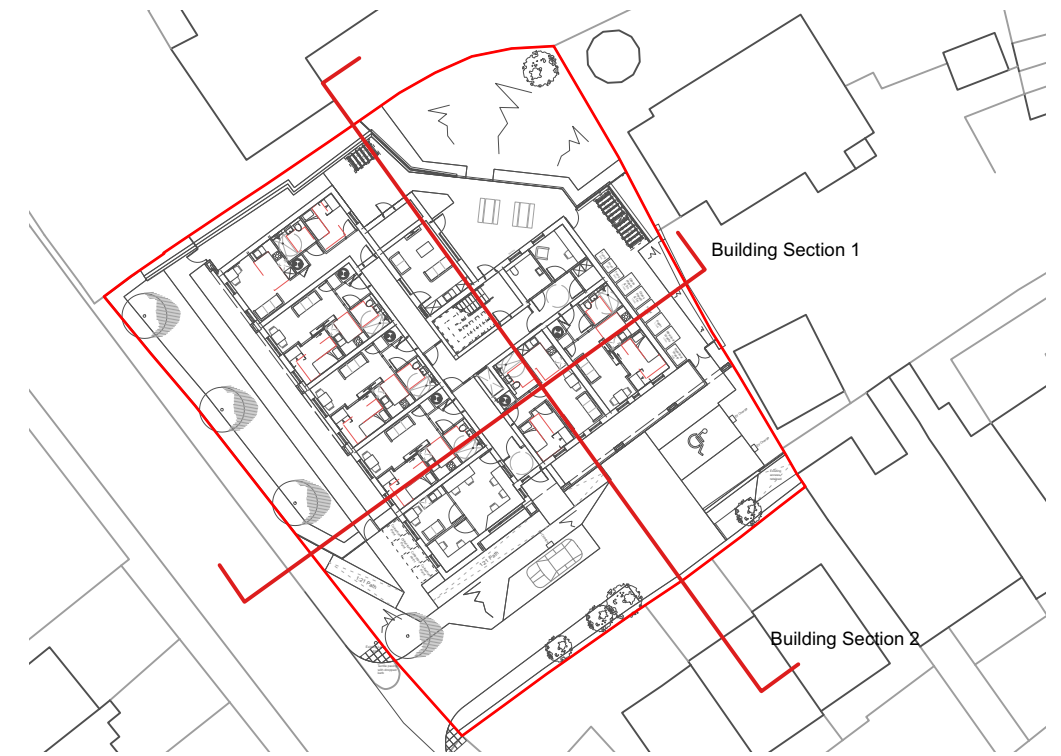
Site Plan 1:500